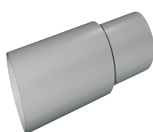
TUBO TELESCOPICO D.150