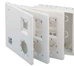
KIT SCB (TRASF.E.C.)