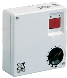
C 1.5 (COMANDO EL. 1.5 A)