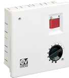
SCNRB SCAT.COM.NON REV.INCASSO